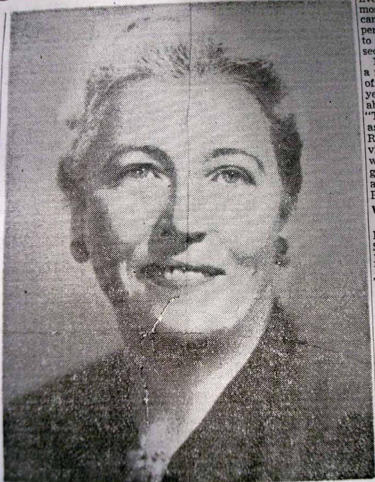
PEARL BUCK : . . Turns Out Her 17th Novel

four more children She settle When she returned to this coun- try in 1932 she was greeted by a